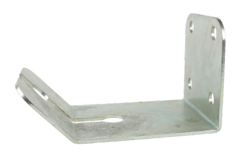
MicroFlow angled bracket

PC software is available to allow setup and run diagnostics using the MicroFlow PC via the RS485 connection. The PC software enables users to be able to set up, test, obtain and record readings from a sensor, giving users an idea of signal strength, stability, device parameters, and much more.