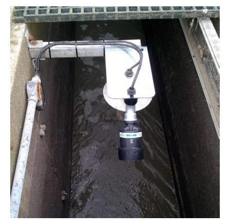
MicroFlow and dBMACH3