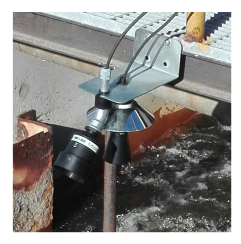
MicroFlow and dBMACH3 in a wastewater application

Thanks to Pulsar's award-winning and world-leading non-contacting technology, the MicroFlow sensor range does not include any serviceable parts and because it makes no contact with the application, there are no wear and tear issues.