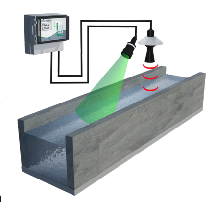
MicroFlow combined with dBMACH3 and FlowCERT

The K-Band radar technology works by using short pulses of microwaves, which are transmitted by an enclosed antenna on the face of the unit. When reflected off a moving surface, the signal experiences a shift in frequency characteristic. The reflected signal is captured by the on-board microprocessor via the antenna and analyzed to determine the velocity