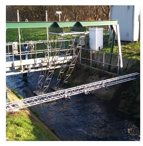
3 MicroFlow's on a wide channel